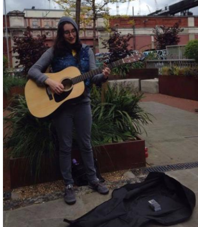
Busking in Waterloo, London.