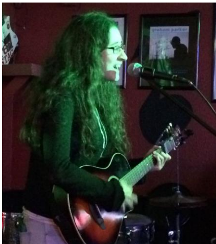
Jiggs, Butler, NJ.

She can be found performing regularly at cafes and bars throughout New Jersey. Examples include The Fine Grind (Little Falls and formerly Wayne), Espresso Joe’s (Keyport), Java Love (Montclair), Rock ‘n’ Joe Coffee Bar (Union), Jiggs (Butler), and Clash Bar (Clifton).