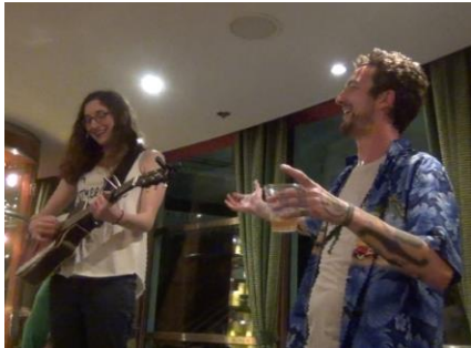
Guest spot during an informal acoustic set by Frank Turner on the Flogging Molly Cruise.

She has been unofficial itinerant musician on Flogging Molly's punk rock Salty Dog Cruise for three years in a row, which has led to some incredible adventures, including performing with and befriending her favorite artist, Frank Turner.