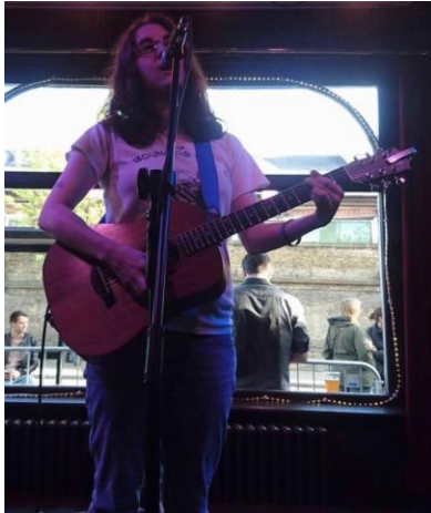
Headlining the official fan meet-up/pre-party for Frank Turner's Lost Evenings Festival in London.

She has performed in nearly a dozen different cities across England (her second home) in every capacity from busking and house shows to open mic feature sets to opening for folk singers.