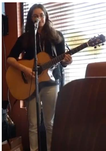
The Fine Grind, Little Falls, NJ.