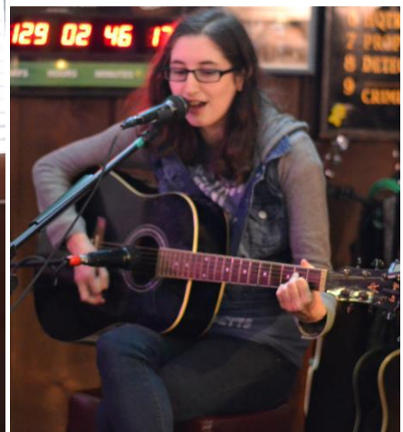
Poor Henry's, Montville, NJ.