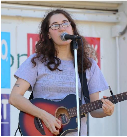
Lincoln Park Day (NJ) 2017.

She plays at outdoor events in the fall, spring, and summer, and has regularly busked in public places, particularly at NJ Transit train stations through their Music in Motion program.