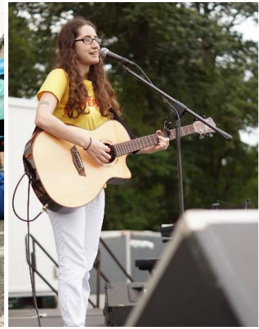
Lincoln Park Day 2018.

She has been unofficial itinerant musician on Flogging Molly's punk rock Salty Dog Cruise for three years in a row, which has led to some incredible adventures, including performing with and befriending her favorite artist, Frank Turner.