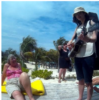
Serenading fellow cruisers in a cabana on Great Stirrup Cay.