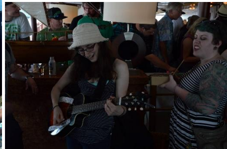
Singalong at the cruise welcome party.