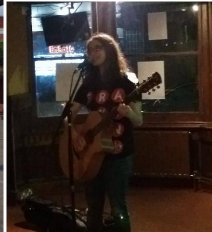
Bull Pub, Colchester, UK.